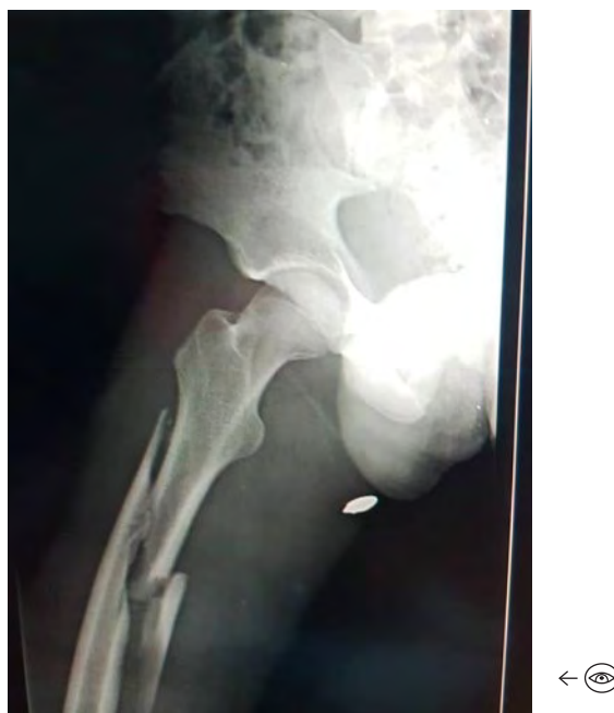
M.A.X.'s X-ray taken at the Dr José María Benítez de la Victoria Hospital, January 2019.

The jurisprudence of the Inter-American Court has established that, in addition to the absolute demonstrable necessity of using lethal force, its use must be proportionate to the level of resistance offered at any given moment and “the level of cooperation, resistance, or aggressiveness” in order to “use tactics of negotiation, control or use of force, as appropriate”. 114 The details of this case indicate that the GNB used lethal force almost immediately, in order to enable road traffic to circulate and when the blockade posed no risk or threat to the lives of the officials.